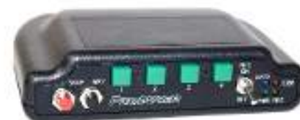
Producer - Video Control Unit

U174 Helicopter Headset Cable Bose Headset Cable GA Headset Cable 3.5mm AUX Input or Output Cable (All Genders Available)