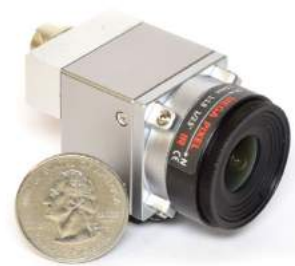
HD29 Interior Camera

Image Quality ★★★★★ Image Processing ★★★★★ Low Light ★☆☆☆☆