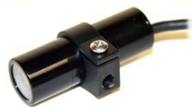
HD19 Micro-Bullet Camera

Image Quality ★★★★★ Image Processing ★★★★★ Low Light ★★★★★