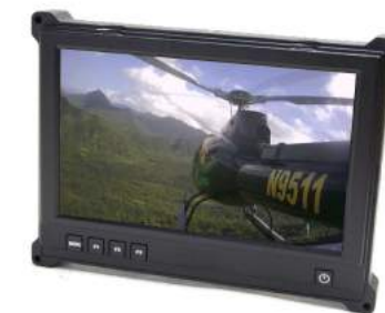
7" HD Monitor