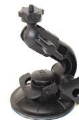
Locking Suction (Interior)