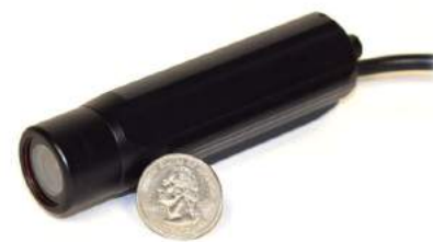
HDX Flight Tour Camera

Image Quality ★★★★★ Image Processing ★★★★★ Low Light ★☆☆☆☆